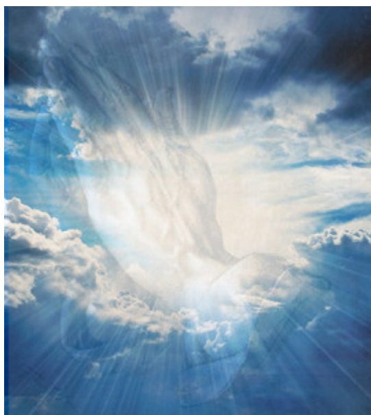
Walking In the Light!